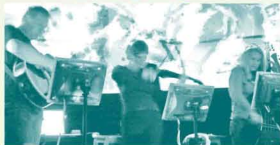
TRIOMETRIK E-music Power Trio